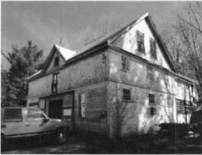
Openshaw Property North Main Street Oakdale, Massachusetts Pictures taken- March 2009